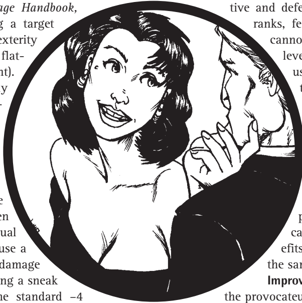
TABLE 1.9: THE PROVOCATEUR

Sleeper Hold: The provocateur is experienced at capturing opponents for interrogation or ransom. At 8th level, his threat range with grapple checks is increased by 2, and if he chooses to inflict damage as part of a grappling attack, he may inflict double (×2) normal damage, though this damage must be subdual.